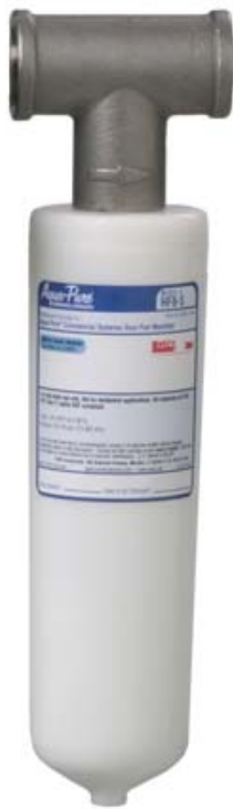
SF18-S System (HF8-S Replacement Cartridge)